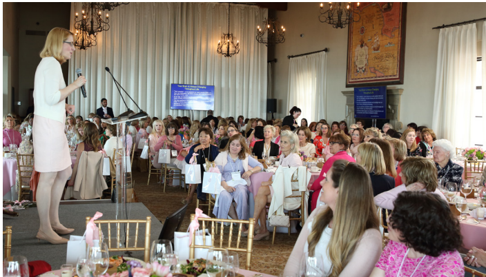
Irene Dunne Guild - Think Pink

We support our patients both in person through our support groups and online with numerous education and informative PNI blogs .